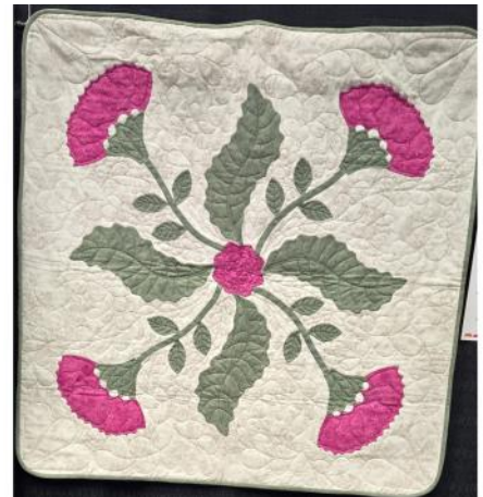
"Princess Feather" by Shirley Kasprzyk