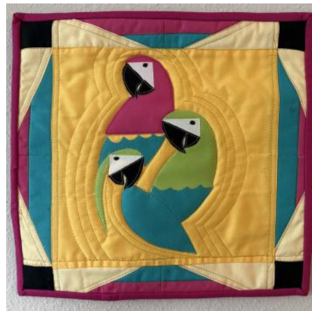
"Parrots" by Ritu Haldar