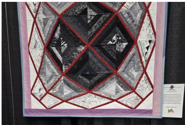
"Fish Eye" by Fazie Mohamed