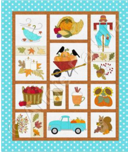
Sample of Autumn Vibes Appliqué Pattern by Angie Padilla Quilt Designs

As a gentle reminder, there will be three categories for this challenge: