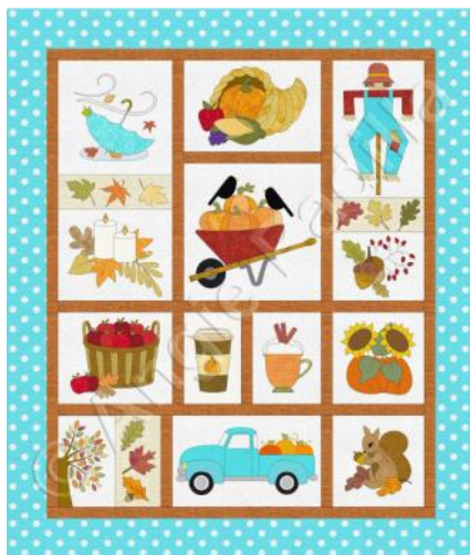
Sample of Autumn Vibes Appliqué Pattern by Angie Padilla Quilt Designs