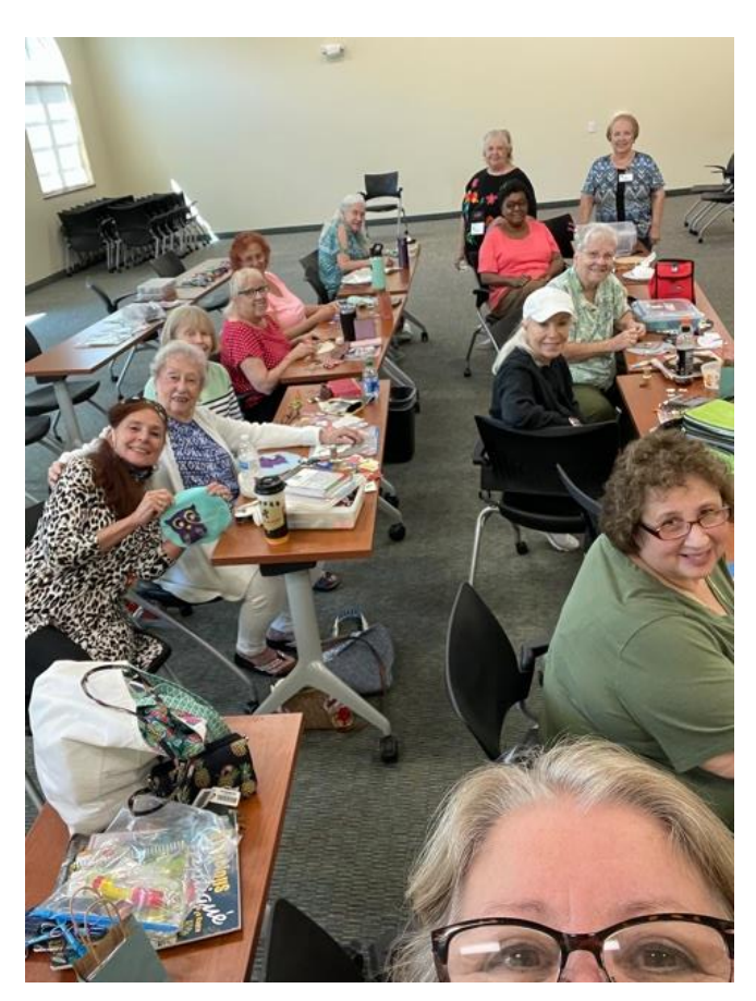
Members of the Crazy Wool Appliqué Group at their Open House

We extend our very best wishes and good luck to each of you gifted and fun-loving Princesses who participated in making the turkey block. I have additional kits available, if you want to make more—just let me know. There is time to make another block or two, as a few days still remain before the drawing takes place on December 15.